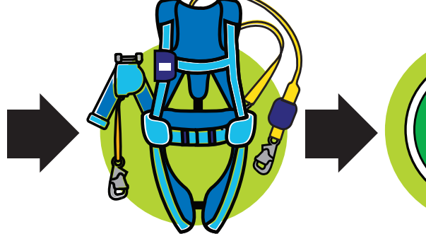
Purchase comparable qualifying* 3M Fall Protection products