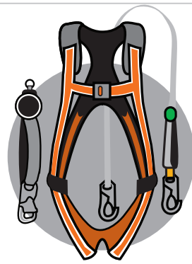
Trade in competitive fall protection products