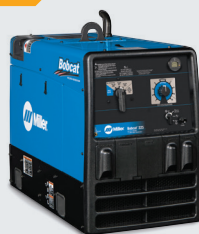
Welder/Generator 907498001 / Grainger #16A173