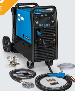
MIG Welder 951766 / Grainger #494D88