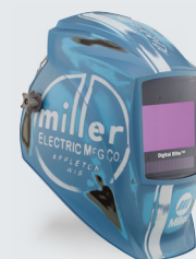
281004 / Grainger #38XK47