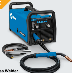
Multiprocess Welder 907693 / Grainger #49KA66