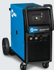
TIG/Stick Welder 907596 (without spool gun) / Grainger #19YW99