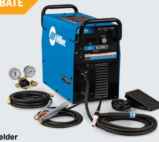
TIG Welder 907627 / Grainger #6DLX2