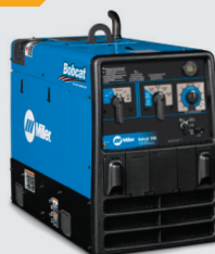
Welder/Generator 907500001 / Grainger #16A175